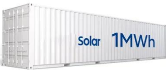
Standard 40ft containers