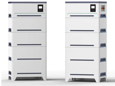
Photo: grid-forming inverter with 10kW power