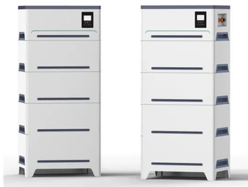
Photo: and configuration for energy storage system